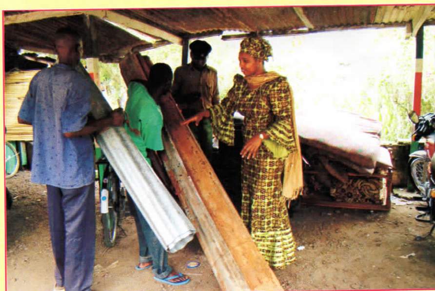
She is receiving the surrendered fighting weapons and items looted from the fighting communities in Kenya.