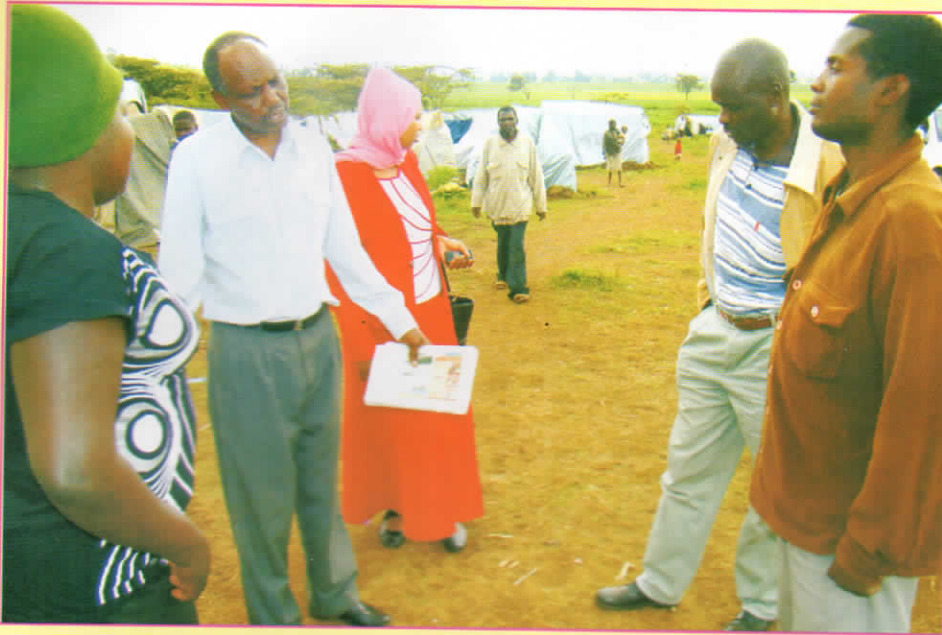
Monitoring her peace efforts made in regions of resettled internally displaced persons