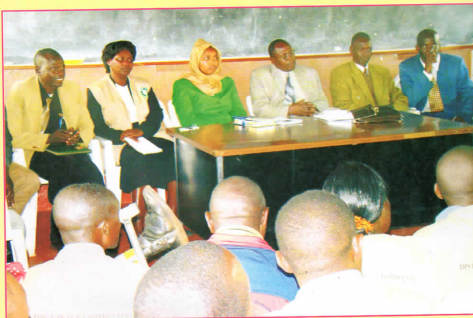
Chebet meeting other peace operators from all regions and neighbouring countries.